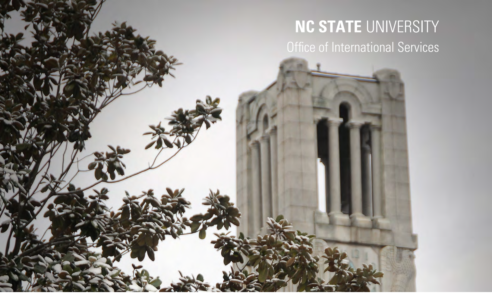
J-1 Student Intern Pre-Arrival Guide